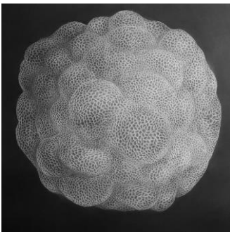
Matrix 3 © Greg Brellochs 2018.