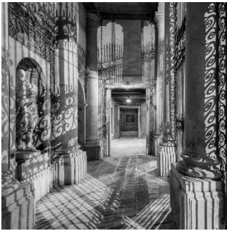
Sotoportego Pisani, Venice © James B. Abbott 2018.

Images are attached to this email and are available upon request.