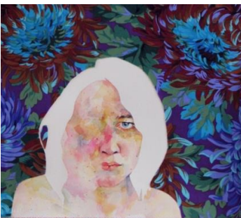
When A Man Decides to Hurt You: Existential © Emily Smith 2016

Images are attached to this email and are available upon request