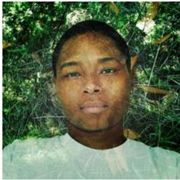
When A Man Decides to Hurt You: Existential, Terasu/Kumorasu, Sabra/SJ