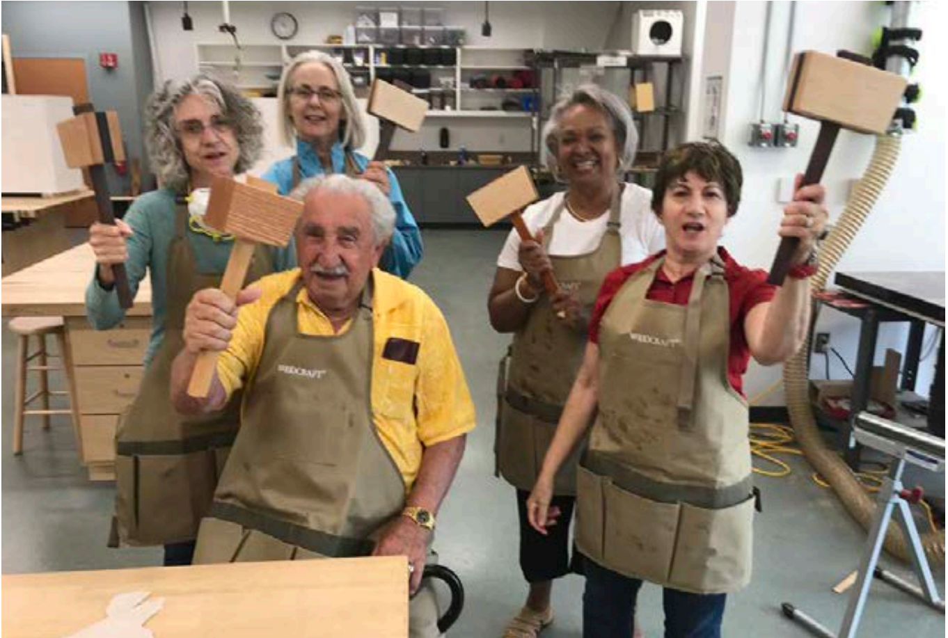
Above: Students from First Cut: Woodworking 101 showing off their mallets