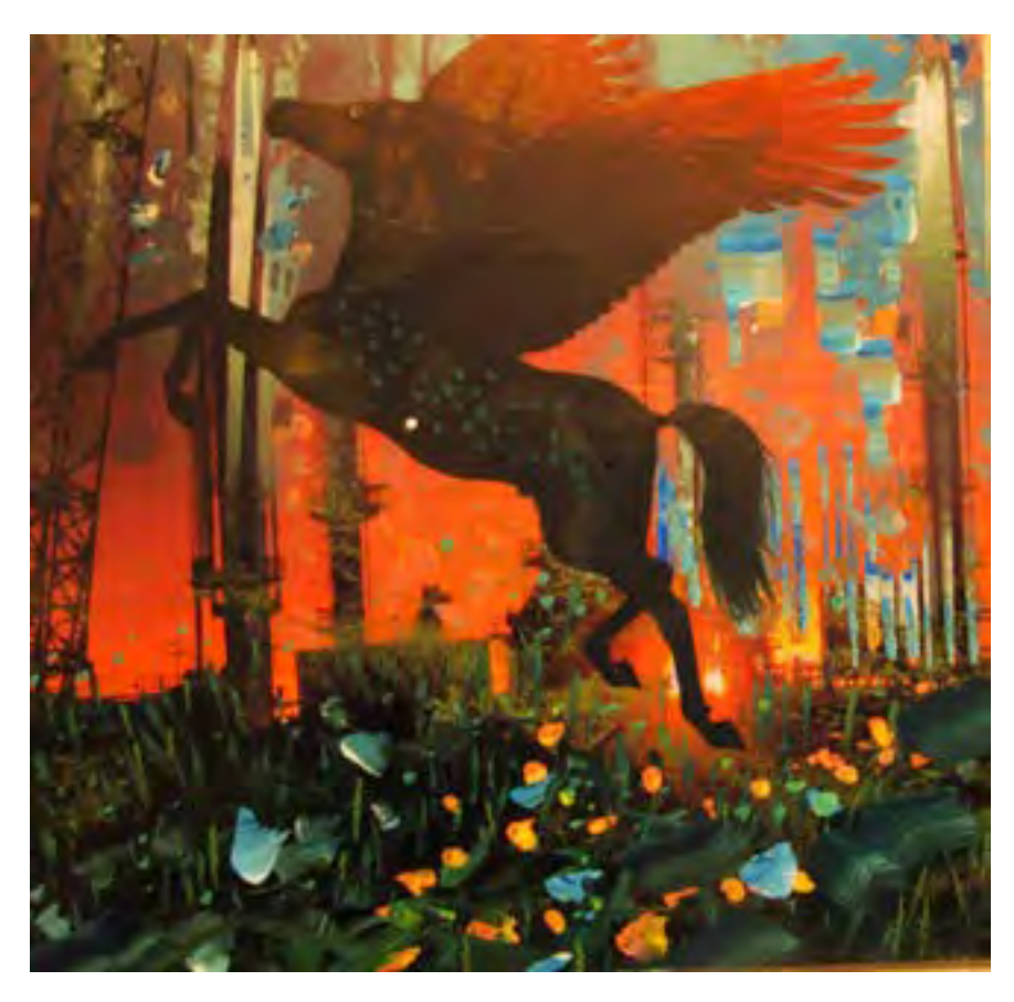
An entry by an anonymous artist in Main Line Art Center's Flipside Community Exhibition and Fundraiser. All Rights Reserved.

The exhibit, Postic says, is meant to correlate directly with Main Line Art Center's mission: to make art more accessible to a diverse range of people, but also to give all artists a platform, regardless of their status in the artworld.