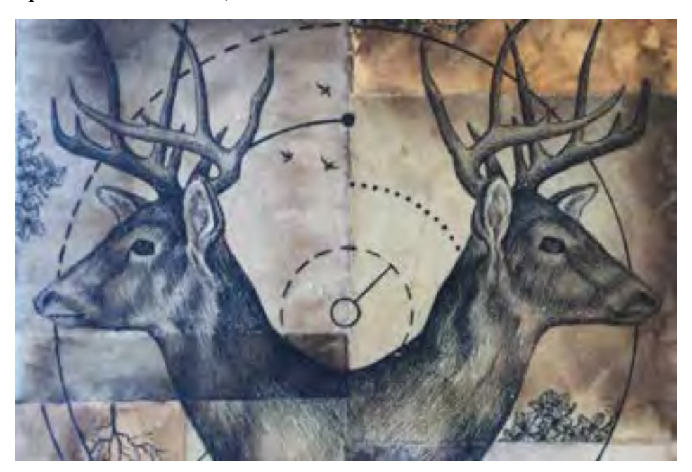
MAIN LINE ART CENTER

An entry into Main Line Art Center's Flipside Community Exhibition and Fundraiser. All Rights Reserved