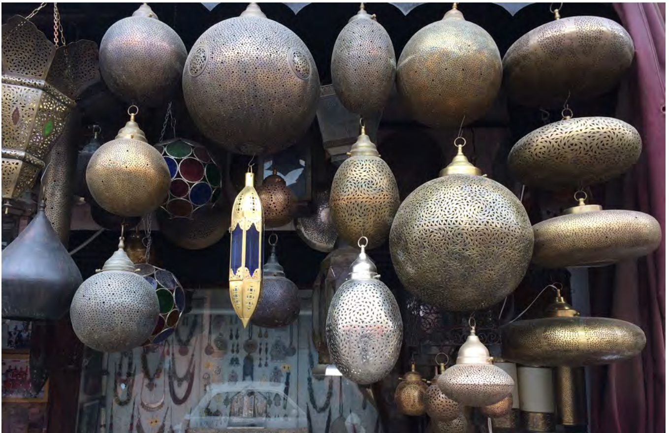
Above: Lanterns on display