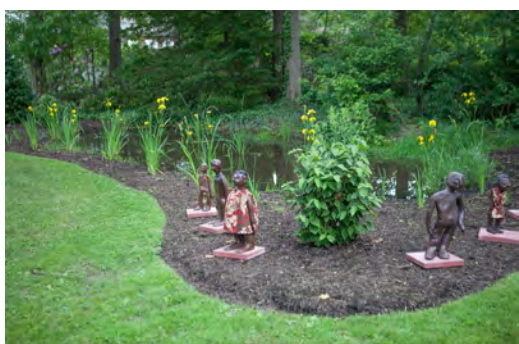
Below: Scenes from Sensory Garden Party 2016