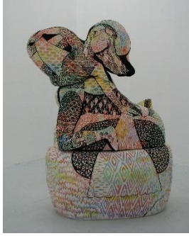
Self Creation (as the meaning of life) © Kelley Donahue 2014