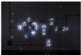
Portals © Joanna Platt 2015