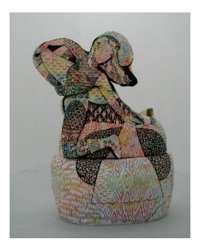
Self Creation (as the meaning of life) © Kelley Donahue 2014