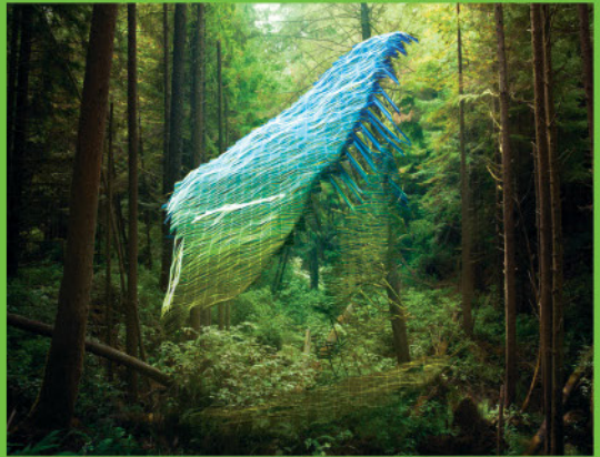
From left: untitled28 and untitled20 © Mark Dorf 2012