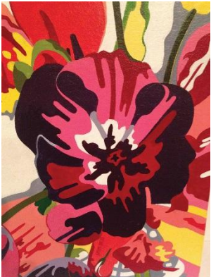
Phyllis Steinberg Orchid Burst 12" x 16" Acrylic on canvas