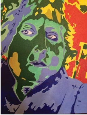
Phyllis Steinberg Sometimes Blue 20" x 20" Acrylic on canvas