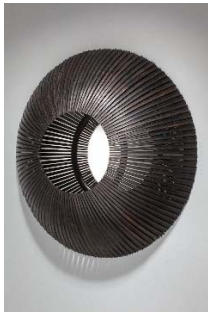
Don Miller Black Mirror 2015