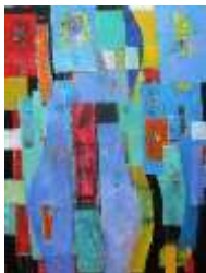
Deconstructed Figure #3 Adam Levin 2015