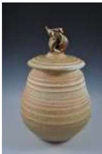
Sweet Cream Twirl Kay Moon 2015