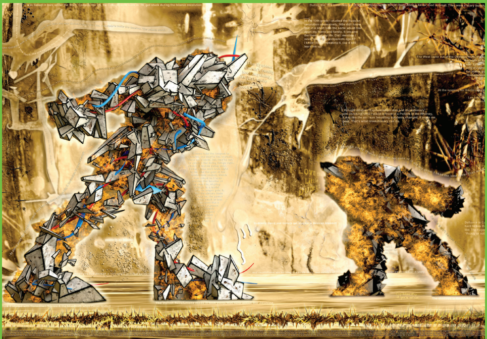
David and Goliath