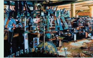
Spin the Bottle © Craig Morgan

The Spring Gala Exhibition features professional 2 and 3-D works in a variety of styles and price points. Proceeds benefit our programs, including Accessible Art programs for children and adults with disabilities.