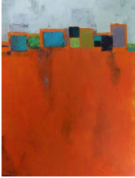
Lori F. Banks Brulée Acrylic on Canvas 30" x 40"

Photographs are attached to this email and are available upon request.