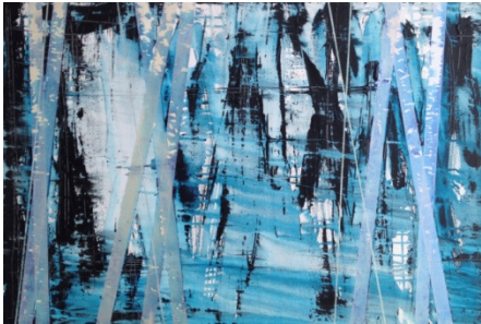
Lori F. Banks Wild Rumpus 1 Acrylic on Canvas 36" x 24" Left Diptych (72" x 24" combined)