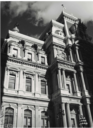
John Begnigno "South Face City Hall" Archival Pigment Print 2013

Images are attached to this email and are available upon request.