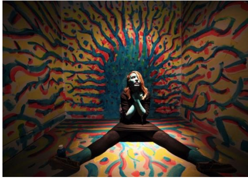
Jennie Thwing "My Black Hole: Cold" Archival Pigment Print 36" x 48" © Jennie Thwing 2013