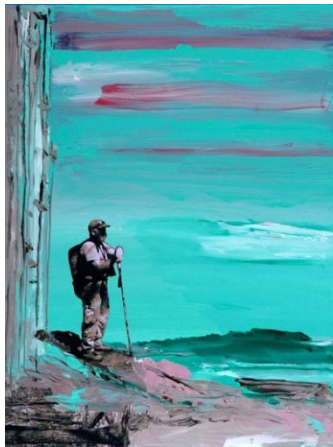
Nic Coviello "Pole Walker" Acrylic and Digital Media on Panel 24" x 18" © Nic Coviello 2012