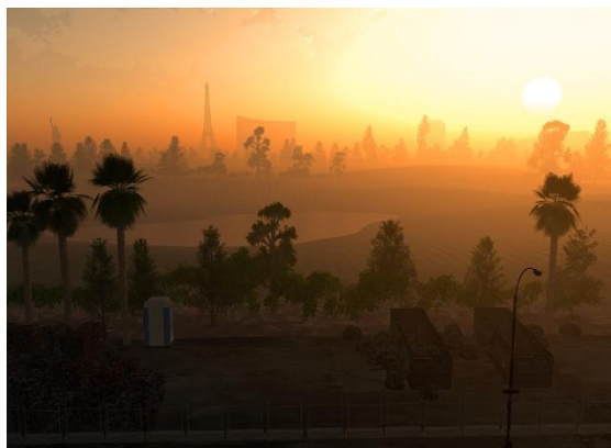
Tim Portlock "Golf" Inkjet Print 54" x 72" © Tim Portlock 2012

Images are attached to this email and are available upon request.