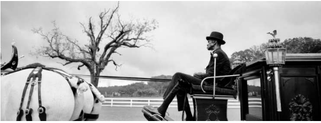
Lori Waselchuk "Lloyd Bone Drives the Funeral Hearse" 20.5" X 46", pigment print, (image 14.5 X 40), edition of 8