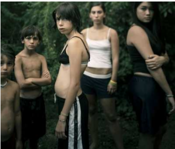
Lydia Panas "Tatiana" 32" x 40" Digital C-Print