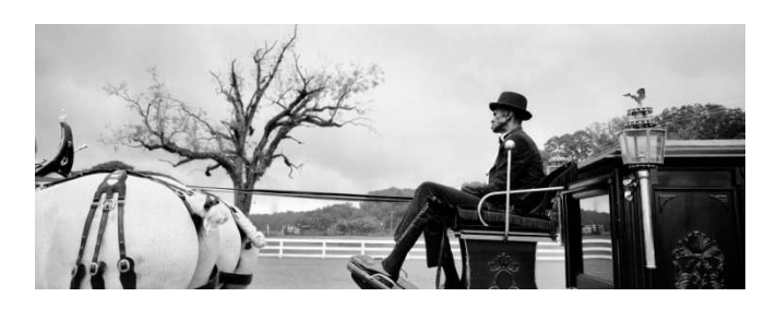
Lori Waselchuk "Lloyd Bone Drives the Funeral Hearse" 20.5" X 46", pigment print, (image 14.5 X 40), edition of 8