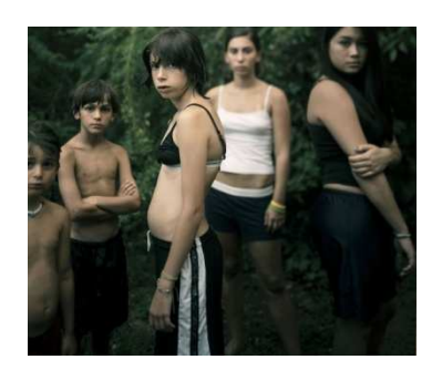
Lydia Panas "Tatiana" 32" x 40" Digital C-Print © Lydia Panas 2005